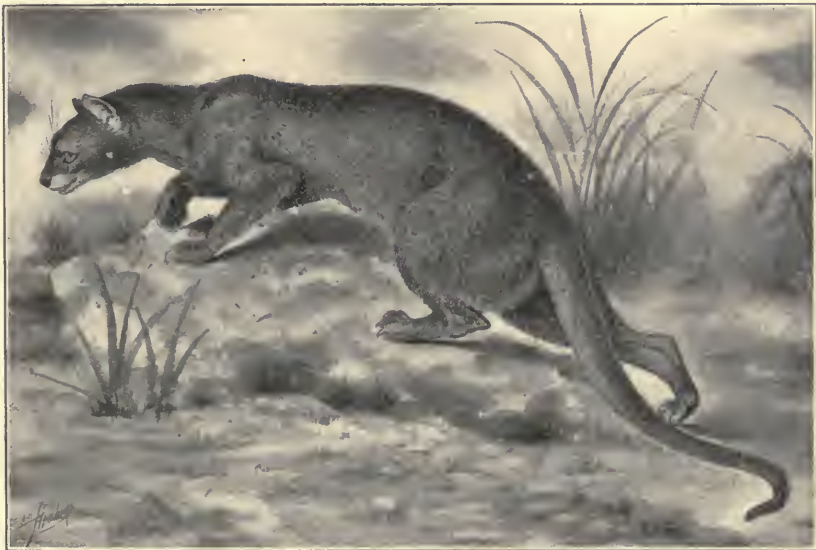
FIG. XLIII. CRYPTOPROCTA FEROX. THE FOUSSA.

Cryptoprocta ferox Bennett, Proc. Zoöl. Soc., 1832, p. 46.